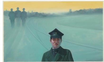
OZAWA Tsuyoshi, The Return of S.T. (detail), 2020 Collection of Hirosaki Museum of Contemporary Art

*Admission to this exhibition is included with your ticket for the KAZAMA Sachiko: Clairvoyance in a 9 m 2 room .