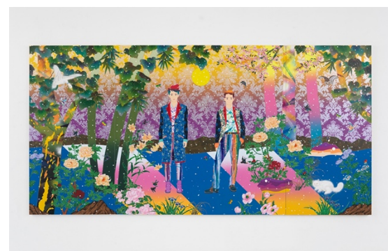
MATSUYAMA Tomokazu, People With People , 2021 Collection of Senya & Company Co., Ltd. Acrylic and mixed media on canvas 213.3x426.7cm