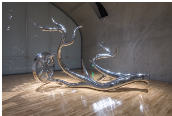
MATSUYAMA Tomokazu, Wheels of Fortune , 2020 Private Collection Steel 257×400×105cm