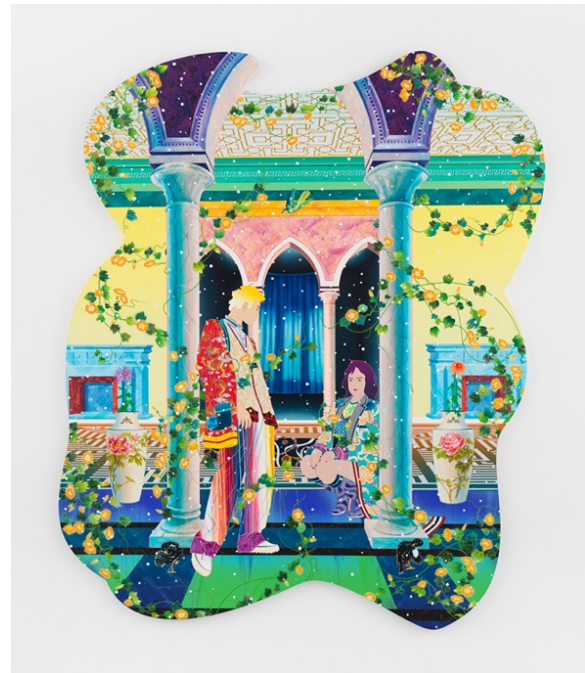
MATSUYAMA Tomokazu, Hello Open Arms , 2023 Private Collection Acrylic and mixed media on canvas 257×216cm

The exhibition, " MATSUYAMA Tomokazu: Fictional Landscape ," showcases Matsuyama's artistic evolution and sophistication. It places a spotlight on his recent works, produced during the COVID-19 pandemic, and introduces new pieces to the public for the first time. This event in Hirosaki, a city known for embracing new cultures, offers a unique opportunity to see the artist in a fresh perspective.