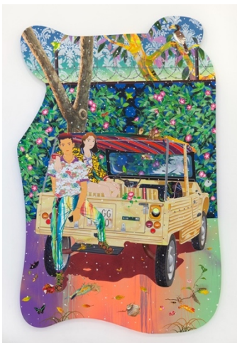
MATSUYAMA Tomokazu, 20 Dollar Cold Cold Heart , 2019 Private Collection Acrylic and mixed media on canvas 267×172cm

The English title, " Fictional Landscape ," draws from a signature series in Matsuyama's portfolio. It encapsulates the idea of an imaginative, otherworldly realm—a place that feels familiar, yet remains elusive and "somewhere else."